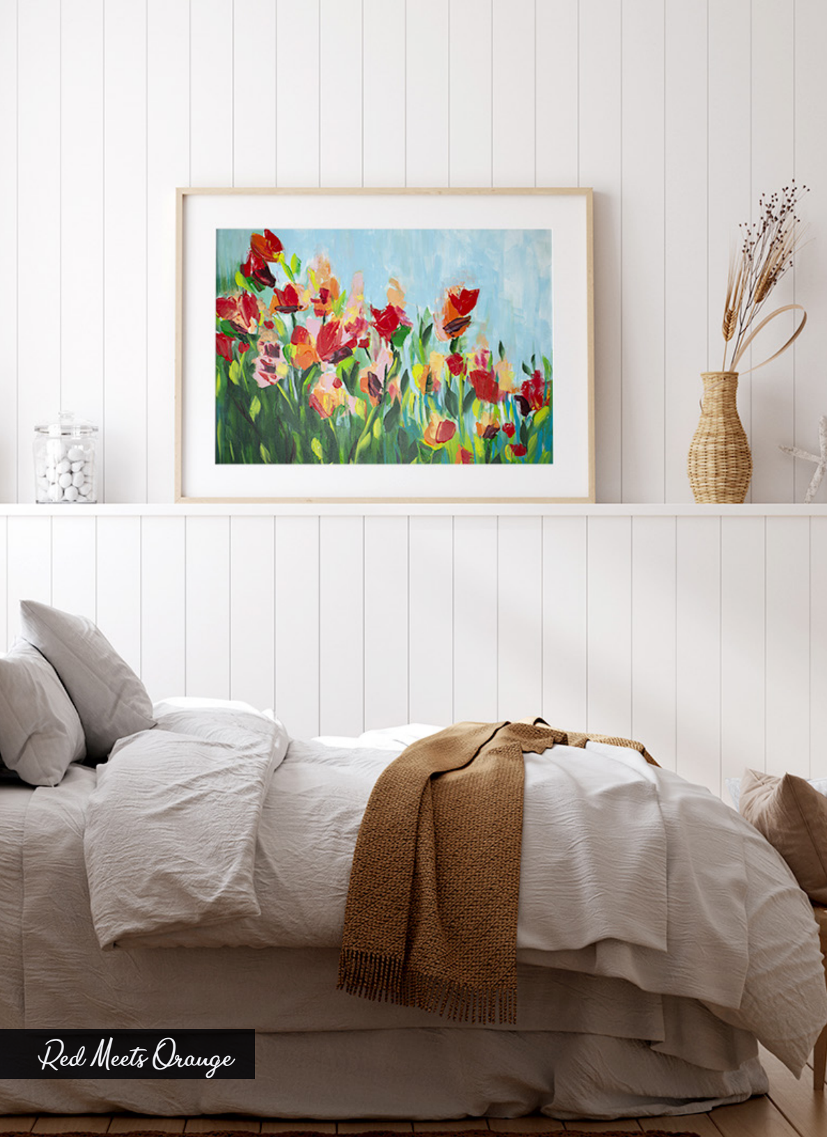
Red Meets Orange