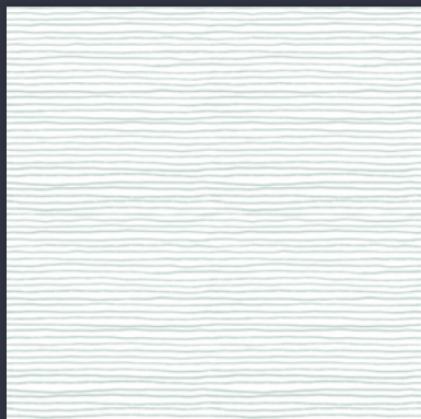
Sweet Safari - Stripe