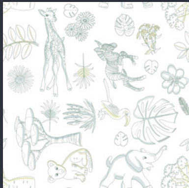
Sweet Safari - Animals