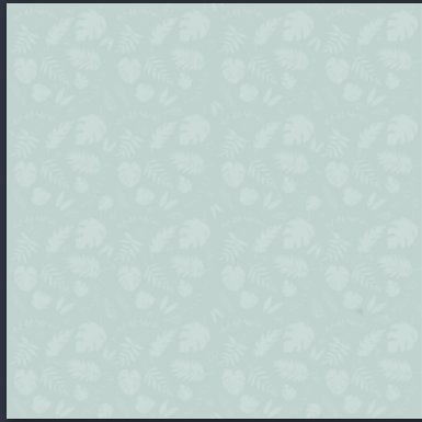
Sweet Safari - Solid Leaf

Is there anything more beautiful than a coordinating pattern set? I love designing with the whole room in mind. The Sweet Safari set is one example of how my paintings (see page 5) and several patterns can work side-by-side in a well executed set.